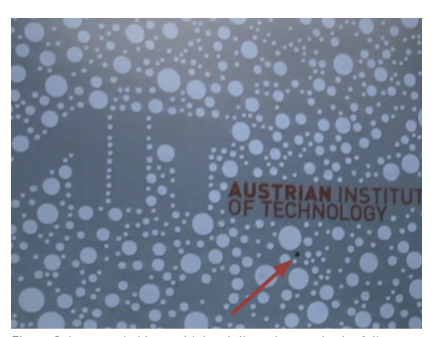
Figure 2: Inspected object, with local distortions and print failure (black spot under Technology)