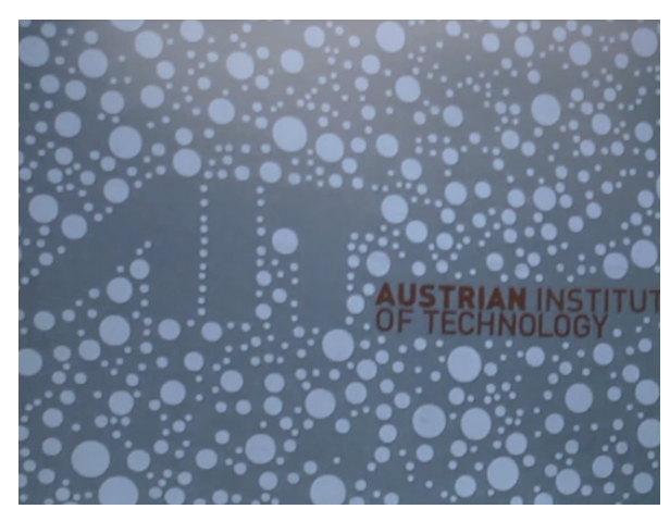
Figure 1: master image

"FlexInspect" is an innovative method for fast and highly precise image registration. FlexInspect allows a quick and very accurate correction of geometric image distortions taking place in the optical quality inspection. Only then it is possible to perform detailed comparison against a "target template" in order to detect any undesirable production deviations.