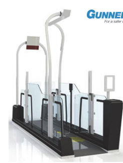
Possible new design of egates, by partners Magnetic and Gunnebo